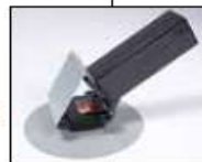
GOALSETTER'S GROUND ANCHOR